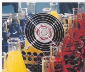
Forced Air Convection Delivers Excellent Temperature Uniformity